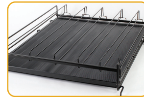
GRAVITY FLOW SHELVING