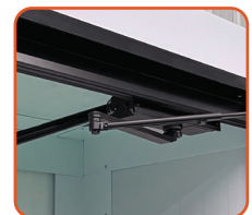
HYDRAULIC DOOR CLOSURE