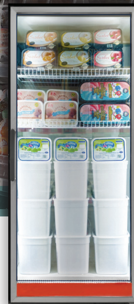
EcoLED (85 CRI)