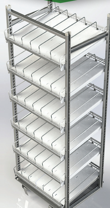
*5 Shelves are standard (shown with 6) 5 dividers per shelf, welded side guards