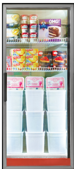
EnVision 2 (95 CRI)